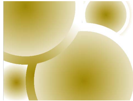
Figure 3: Screenshots of Nora's backgrounds

She referred to her work as "creative" during the interview: