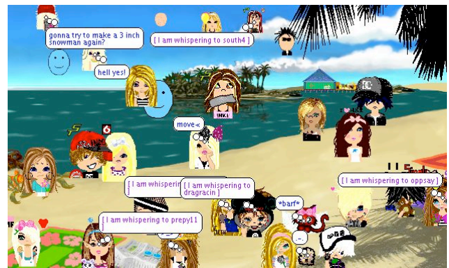
Figure 1: Chatting on the beach in Whyville

Whyville.net is a multi-user virtual environment (MUVE) with over 1.5 million registered players that encourages youth ages 8-16 to play casual science games in order to earn a virtual salary (in 'clams'), which youth can then spend on buying and designing parts for their avatars (virtual characters), projectiles to throw at other users, and other goods such as cars and plots of land. The general consensus among Whyvillians (the citizens of Whyville.net) is that earning a good salary and thus procuring a large number of clams to spend on face parts or other goods is essential for fully participating in Whyville [17]. Social interactions with others are the highlight of life in Whyville for most players and consist primarily of ymailing (the Whyville version of email) and chatting on the site. Chat takes place in many dozen public and private locations in the virtual world of Whyville, where users are visible to each other on the screen as floating faces, typically with shoulders and chests (see the picture of the Beach in Figure 1). Since user-created faces are the primary representation of one's presence on Whyville, looks are very important! Looks also and demonstrate a player's tenure on Whyville and relative experience level; new players stand out as smiley faces, and one of the first tasks newcomers take on is creating a personalized face like those worn by more experienced players.