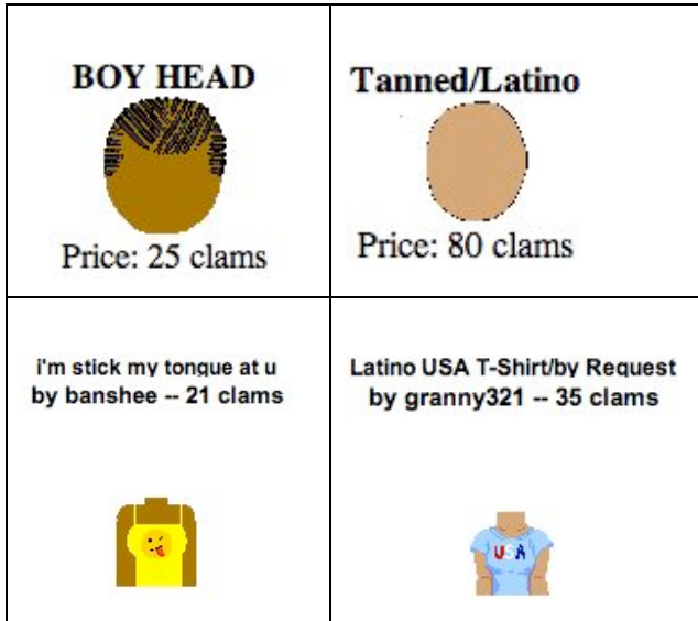
Fig. 2: Examples of non-peach faces and bodies