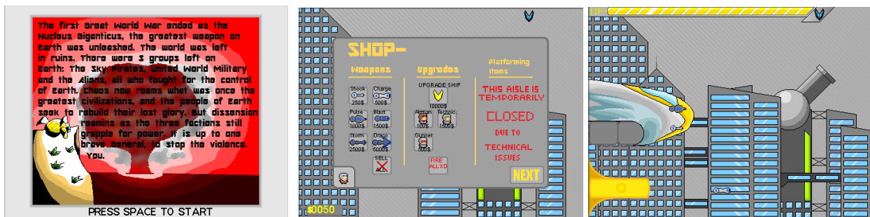
Figure 2: Screen shots of Lumos Scratch story

versions. The Lumos Project was primarily a game with a strong storyline about a ship with different possible crews—pirates, military, and aliens—all fighting for dominion over the Earth (see Figure 2). One Collab Counselor wrote in the comments, “I like the notes of humor—they add a lot. It took me a long time to kill the spaceship, which got a bit boring. Are there instructions? I couldn’t find any. This will be great—keep working on it!” In response, the Lumos team added more touches of humor in the dialog and explanations. They also created a detailed tutorial to explain how to play the gaming parts of the story. The team made many additional changes that went beyond the spectrum of the comments, improving the steering and feel of the spaceship, allowing users to customize the crew and ship, extending the storyline significantly, and adding sound effects. Indeed, the depth and richness of changes made to Dragonfly Lagoon , Lumos and many other interactive stories suggests that our analysis may have short-changed the role of constructive criticism in supporting revisions and learning between the draft and final projects. While it is refreshing to see that Scratch members responded to suggestions, and deepened the quality of their stories on several levels, in the following analyses we examine how these changes played out on the level of code.