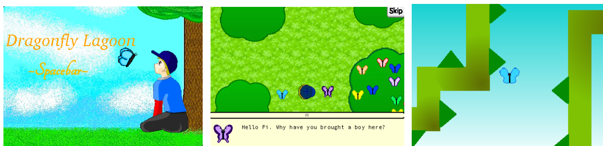
Figure 1: Screen shots of Dragonfly Lagoon Scratch story

Another project, Lumos , illustrates the diverse range of interactive story submitted to the Collab Camp, while the team also responded in significant ways to constructive criticism offered on draft